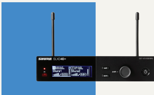
dual-channel digital wireless receiver